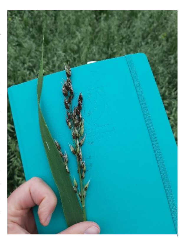
Fig. 1: Loose smut in oats.

Seed disinfectants which combat pathogens on the seed surface. Usually these are products like acetic acid or alcohol. They only work on the surface of seed against diseases like Common bunt but partially also against diseases that are partially on the surface like Fusarium spp. Too high a concentration causes damage of germination.